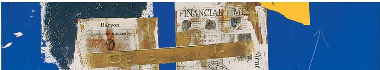
Extract of 'Baryon AG', 2000, Rolf Ziegler